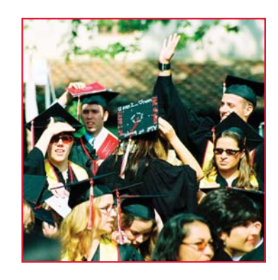
They made it! The Class of 2004 celebrates at Commencement.