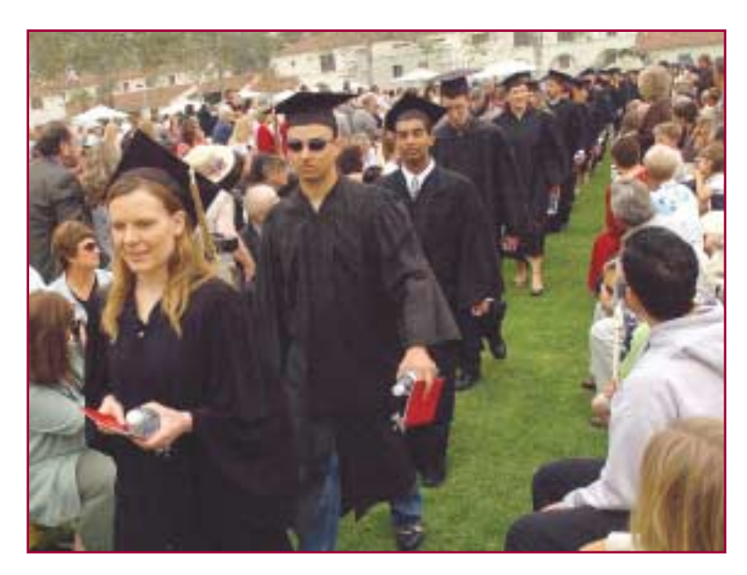
Students process to receive their long awaited degrees.