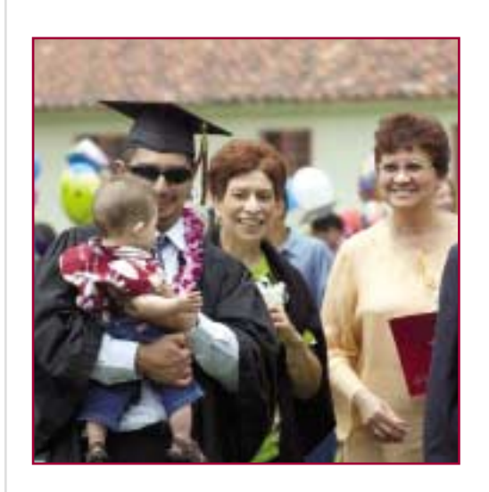
Family members share in the joy of commencement.