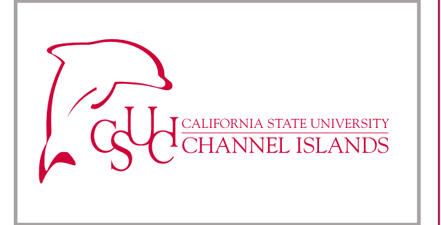
The new official logo will appear on everything from banners to sweatshirts.

An official logo featuring a stylized dolphin jumping over the words "California State University Channel Islands" will also be making its debut on everything from banners to sweatshirts.