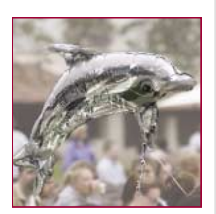
Many flowers, posters, and colorful balloons add to the celebration.