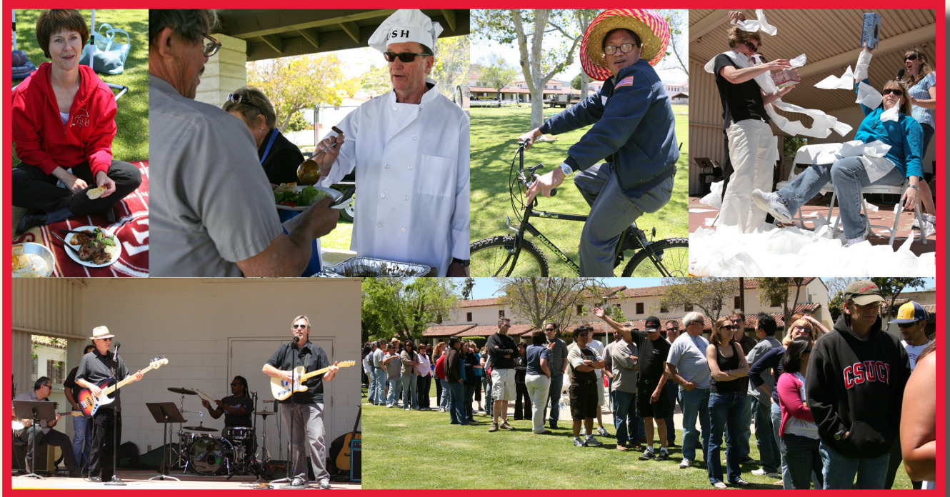
CI President's Cabinet members served lunch to faculty and staff at the annual campus BBQ/picnic. "OPCito" provided live music and awards were presented for employee teams that participated in Walk Across America.