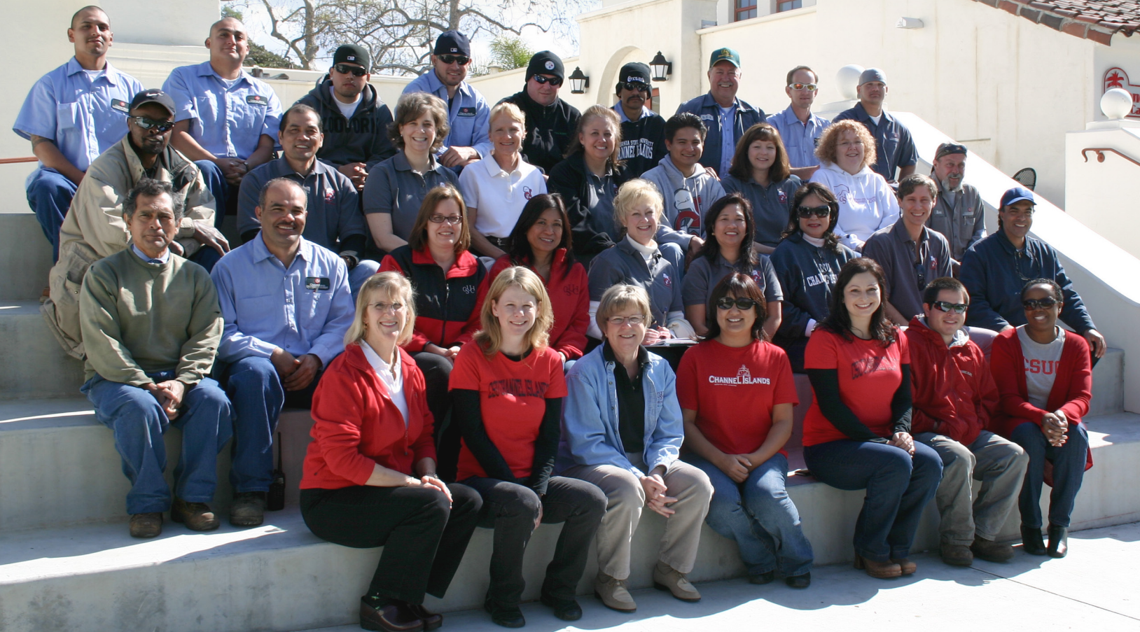
Members of the Division of Finance & Administration show their CI Spirit by proudly wearing their campus uniforms or CI gear.