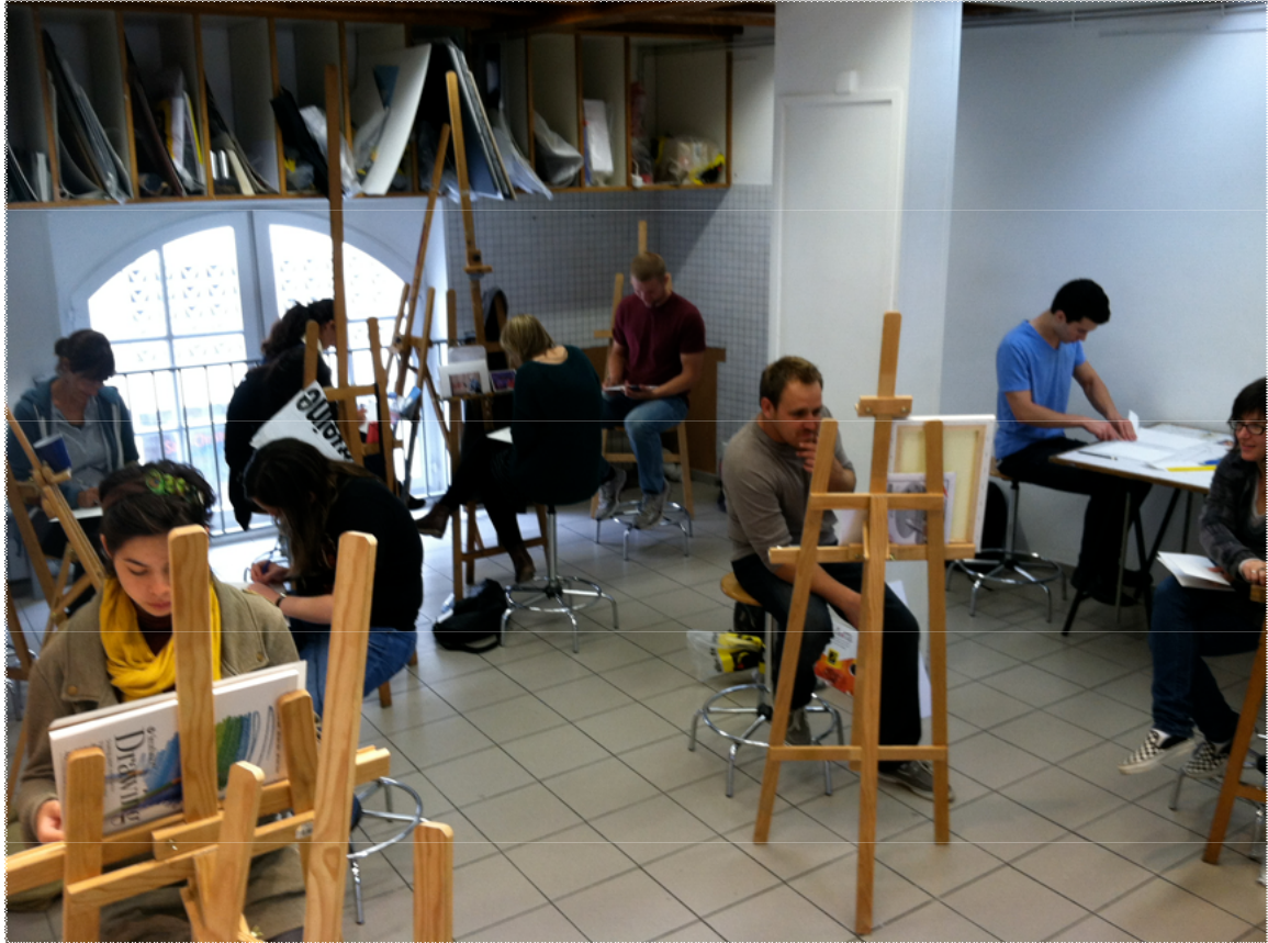
WORKING IN THE PARIS AMERICAN ACADEMY STUDIO