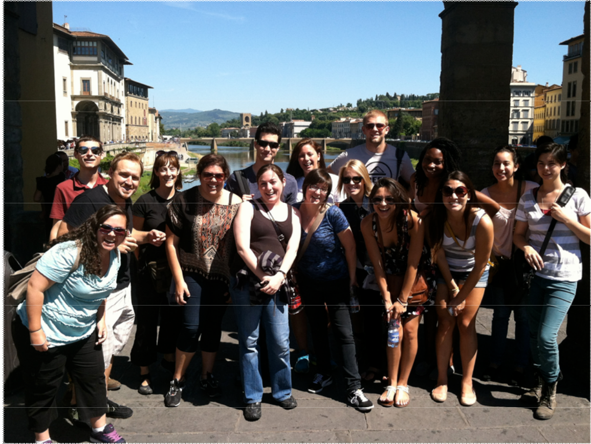
PONTE VECCHIO BRIDGE, FLORENCE