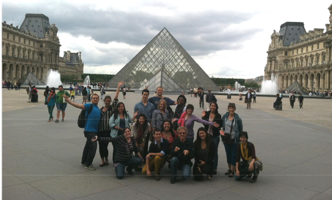
VISITING THE LOUVRE, PARIS