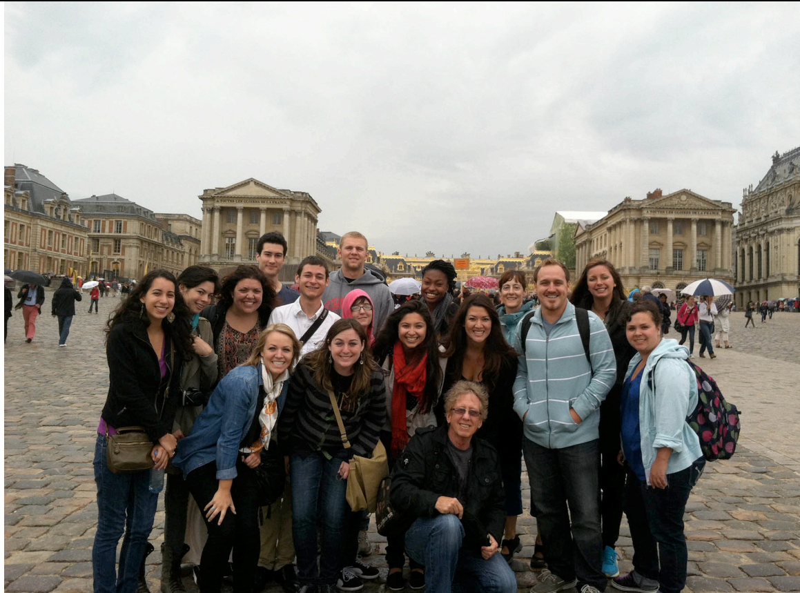
At Versailles, France

**Please attach assessment forms from students, list of attendees, peoplesoft program report: