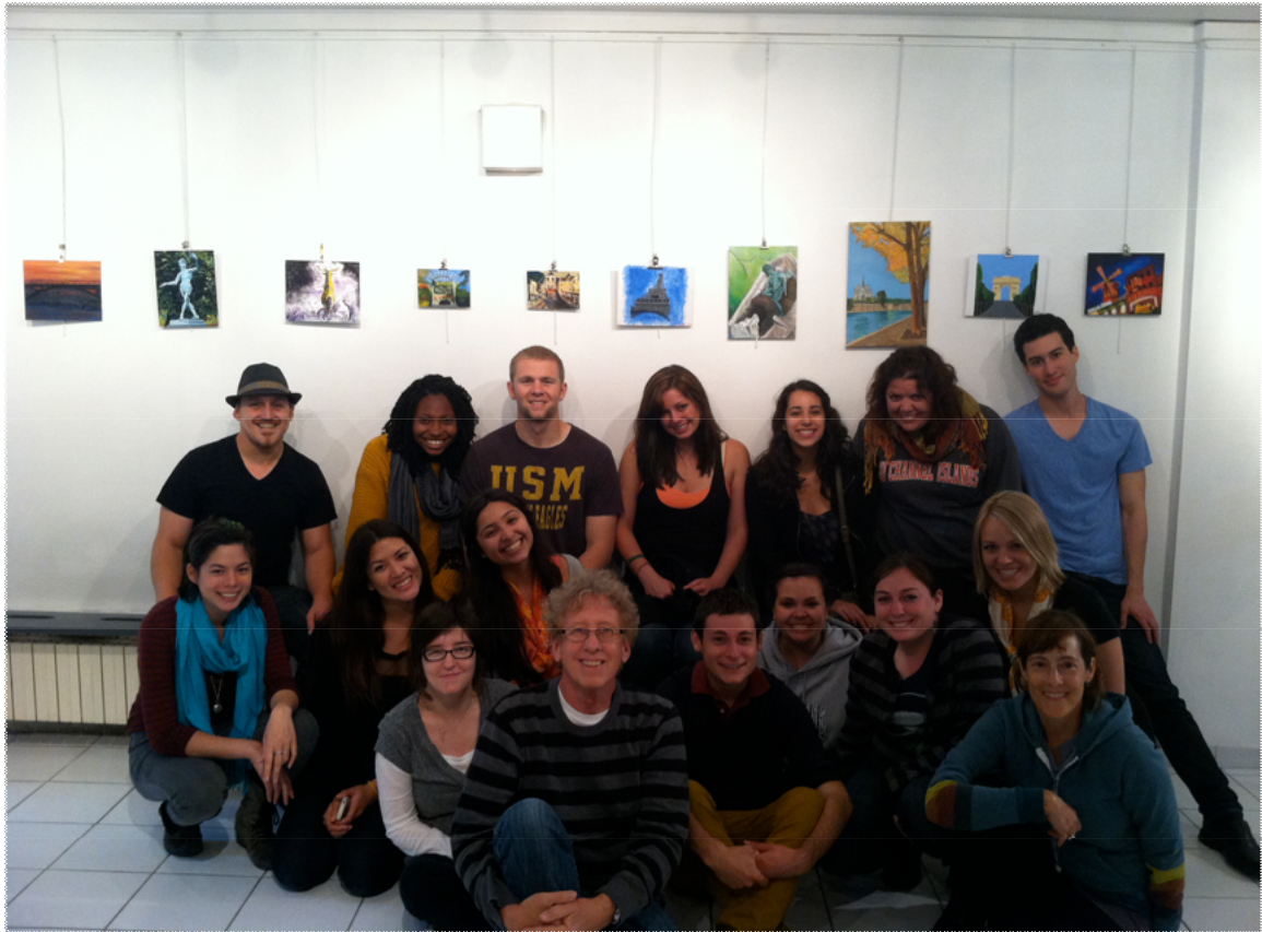
EXHIBITING IN PARIS GALLERY