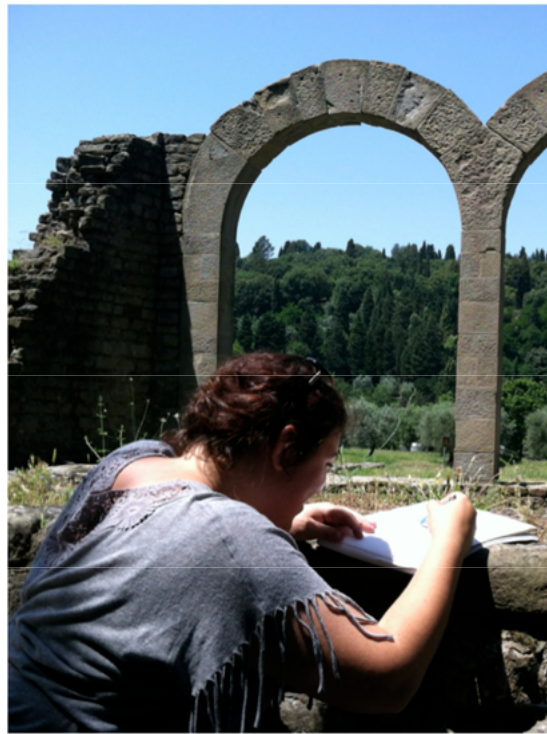
DRAWING AT ETRUSCAN RUINS IN FISOLE, ITALY