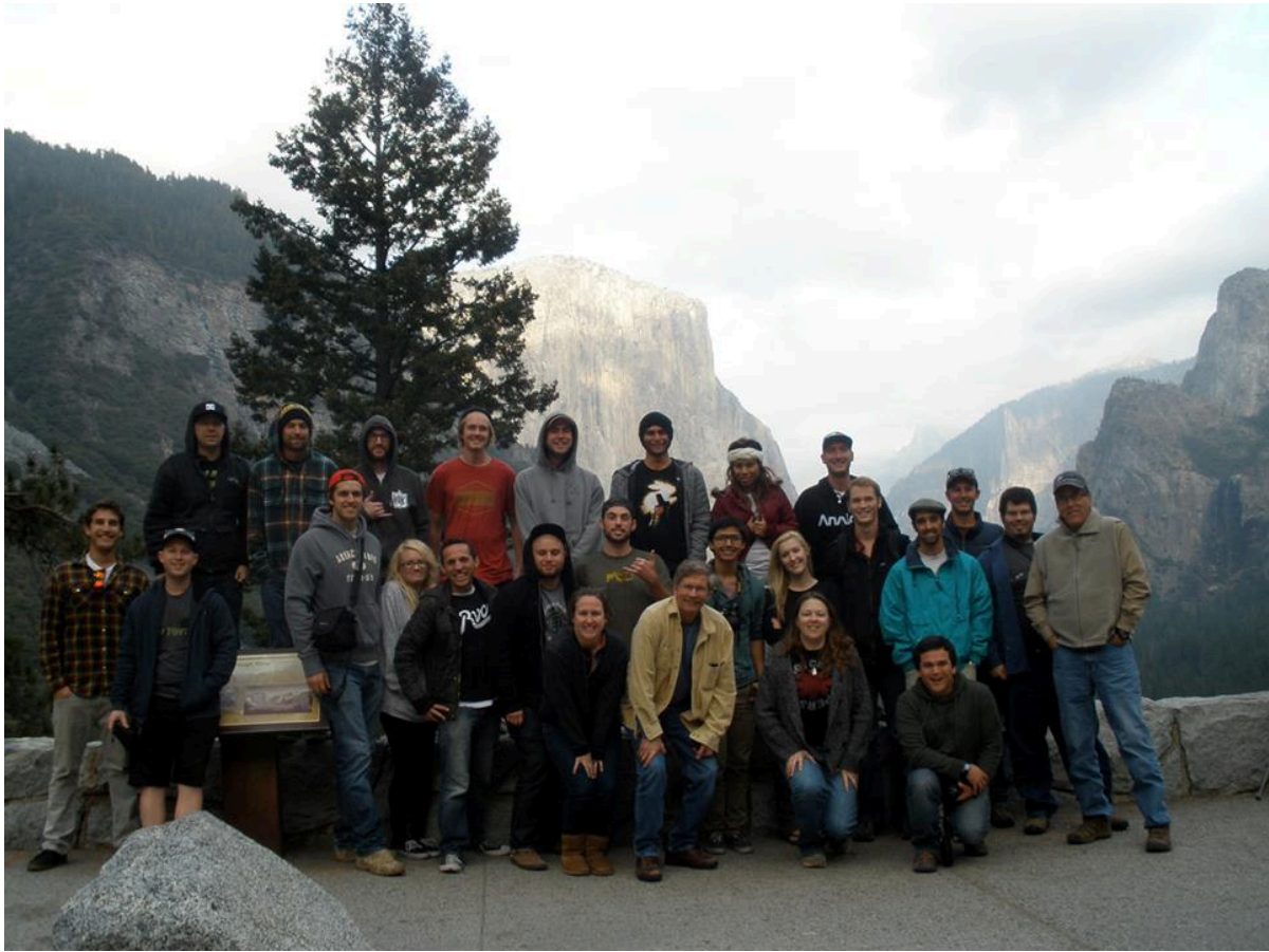
Trip participants at Tunnel View overlooking Yosemite Valley