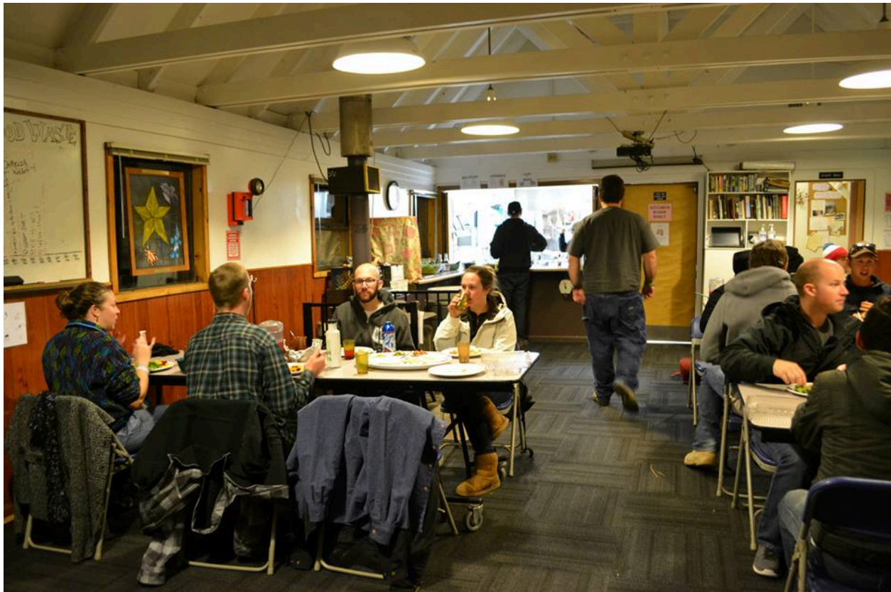
Trip participants stayed at the NatureBridge facility at Crane Flat