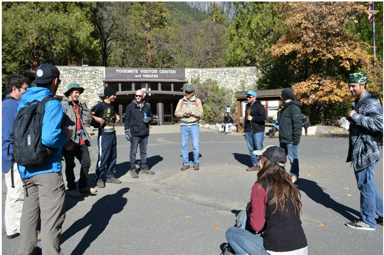
Participants met with the park superintendent and other key park leaders