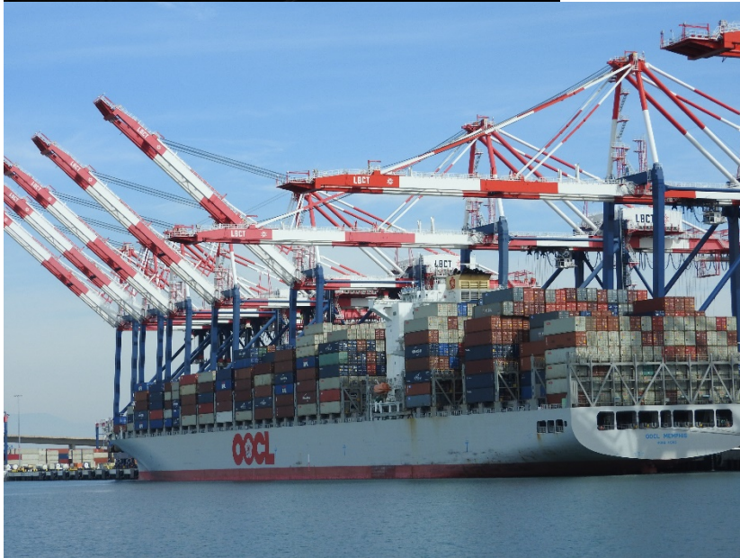
Cargo ship, containers, and cranes together—the enormity of the ships is now tangible.