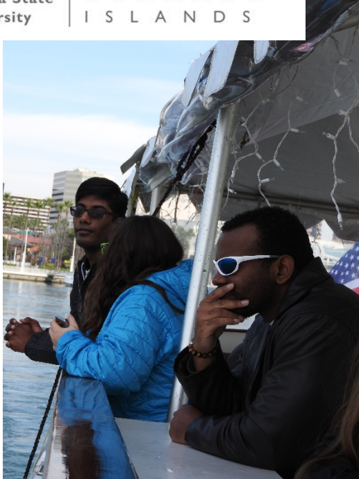
Students looking at the harbor