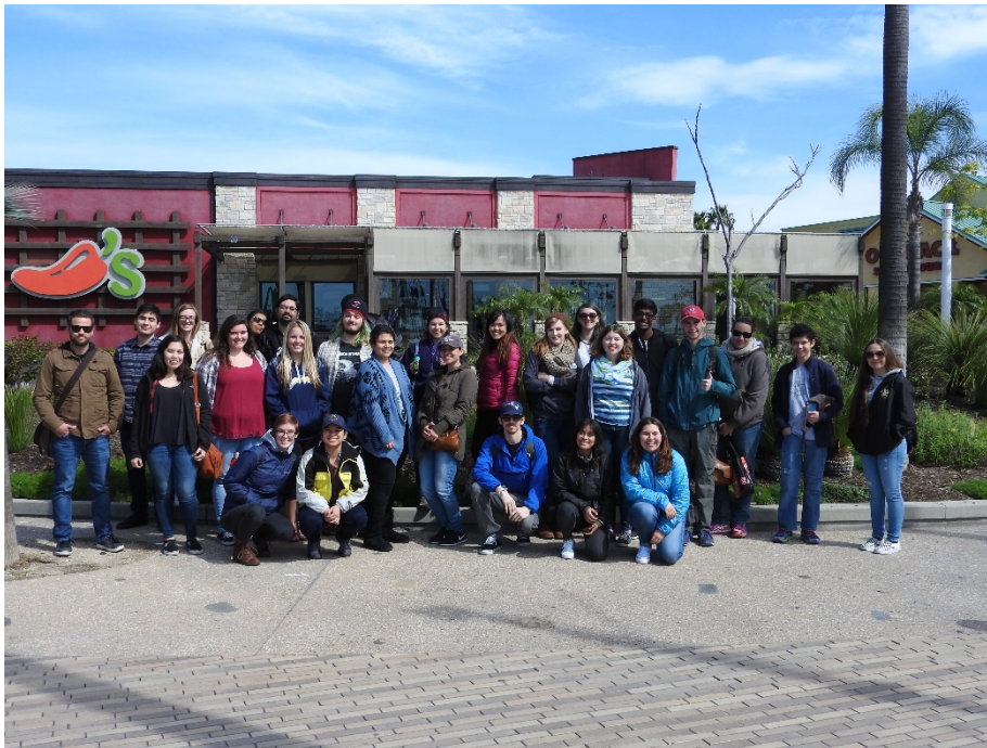
The group just off the boat.