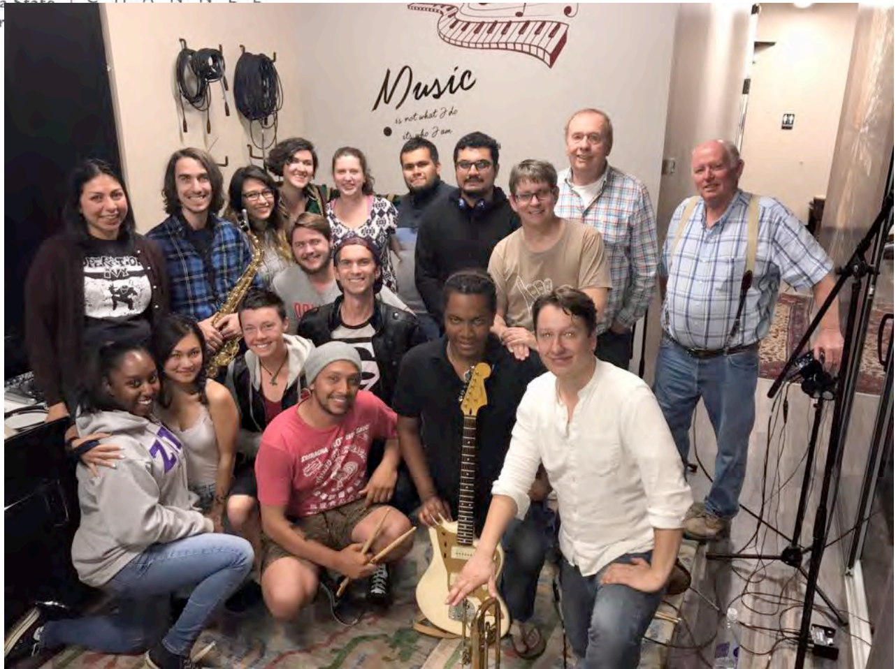
CI's Contemporary Music Ensemble in a recording studio with legendary Beatles recording engineer Geoff Emerick (back row, 2 nd from right.)