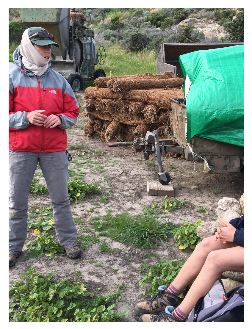
Figure 4: Learning about the cloud forest restoration project, preparing to make waddles fro that project.