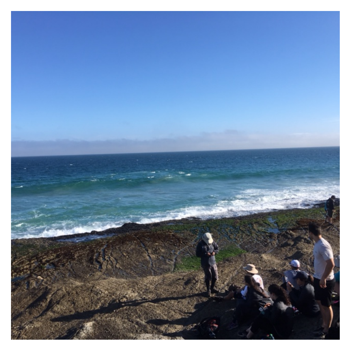
Figure 1: Students preparing to sample the intertidal zone at Skunk point.