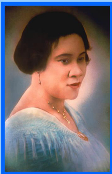
Madame CJ Walker

The brilliant poet, one of the originators of jazz poetry, who together with his close friends Wallace Thurman and Zora Neale Hurston set America ablaze with the Harlem Renaissance. One of the only African Americans to appear before McCarthy's 'Unamerican Committee', this complex man, in contrast to his troubled father, held a deep love for his country on the grounds that it belongs to all Americans, no matter the color.