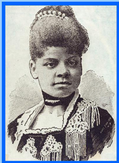
Ida B. Wells

The journalist who, through her writing and activism, refused to allow mainstream America to look the other way and excuse the horrific lynching of black men in the United States.