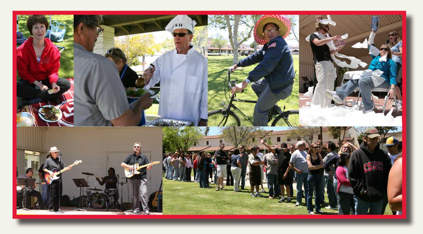
CI President's Cabinet members served lunch to faculty and staff at the annual campus BBQ/picnic. "OPCito" provided live music and awards were presented for employee teams that participated in Walk Across America.