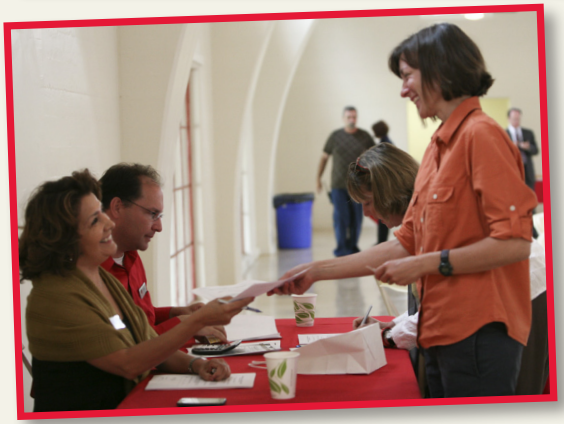
University Advancement and CI Foundation hosted a Payroll Deduction breakfast yesterday. Faculty and staff members were given an opportunity to sign up and demonstrate their support for the University by directing that an amount from their pay checks be donated to the University Foundation.