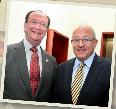
President Rush with Assemblymember Pedro Nava

CI's panel focused on the University's Sustainability Strategic Initiative, efforts to create a sustainable campus operation and environment, and a commitment to course offerings that focus on sustainability. Other panels showcased local businesses in the region and what local governments are doing to encourage growth of green economy in their cities or counties.