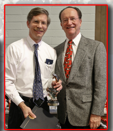
Five Year Ten Year Twenty Year

At each Holiday Breakfast, the University presents its annual service awards recognizing those employees who have worked for the California State University system for five, 10, or more years.