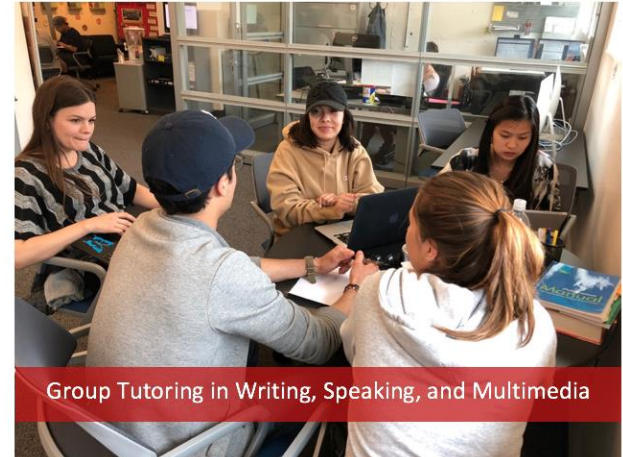
Group Tutoring in Writing, Speaking, and Multimedia

Gave a lot of good feedback and suggestions to improve the paper.