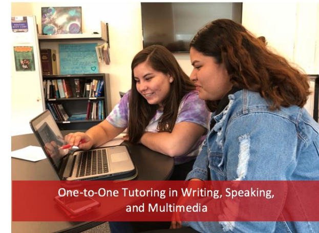
One-to-One Tutoring in Writing, Speaking, and Multimedia