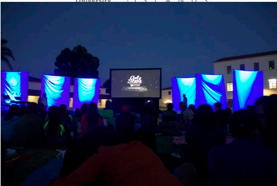
Photo inbetween acts. Arts Under The Stars Video logo created by Erik Scoggan