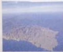
Santa Cruz Island