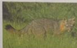
Island fox, Santa Cruz Island