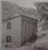
Island house, Santa Cruz Island

http://nps.gov/stcr/planyourvisit/camping.htm