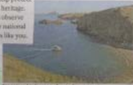
Sturgeon Anchorage, Santa Cruz Island