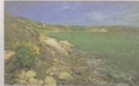
Smugglers Cove, Santa Cruz Island