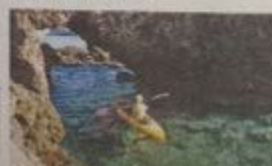
Kayaking, Santa Cruz Island