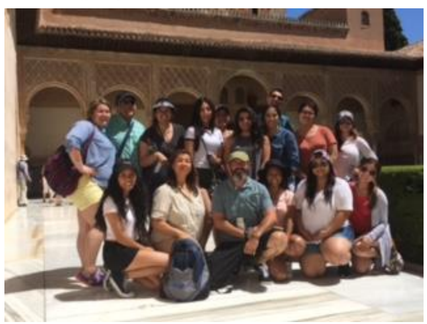
STUDENTS AT THE ALHAMBRA, IN GRANADA