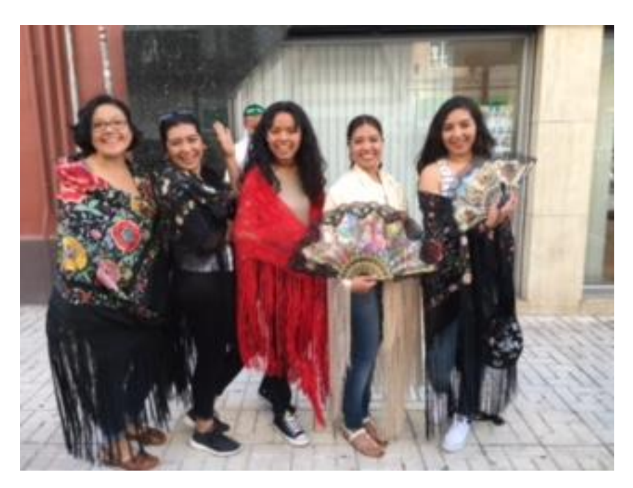
SOME STUDENTS DRESSED IN TYPICAL SPANISH ATTIRE.