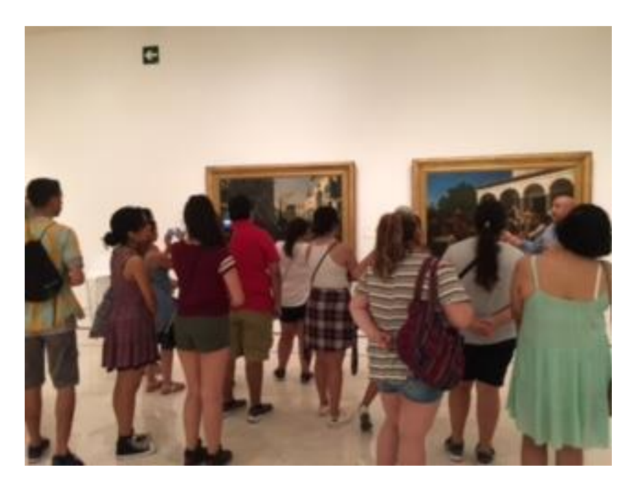
STUDENTS AT THE THYSSEN MUSEUM