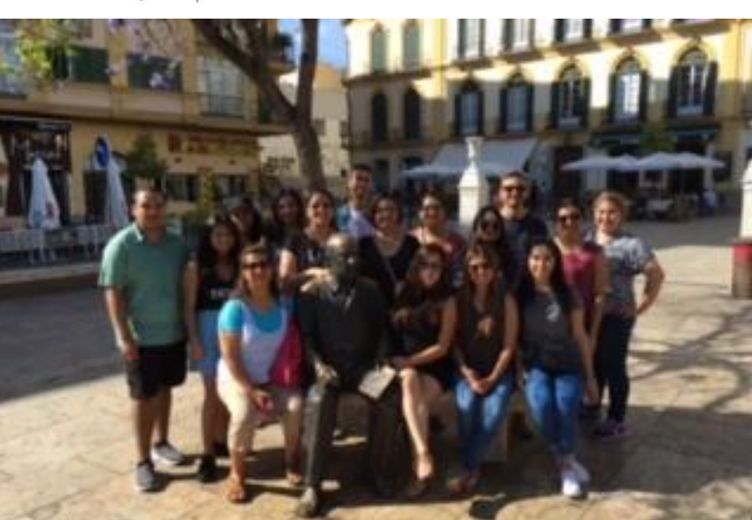
Students in front of the birth place of Pablo Picasso