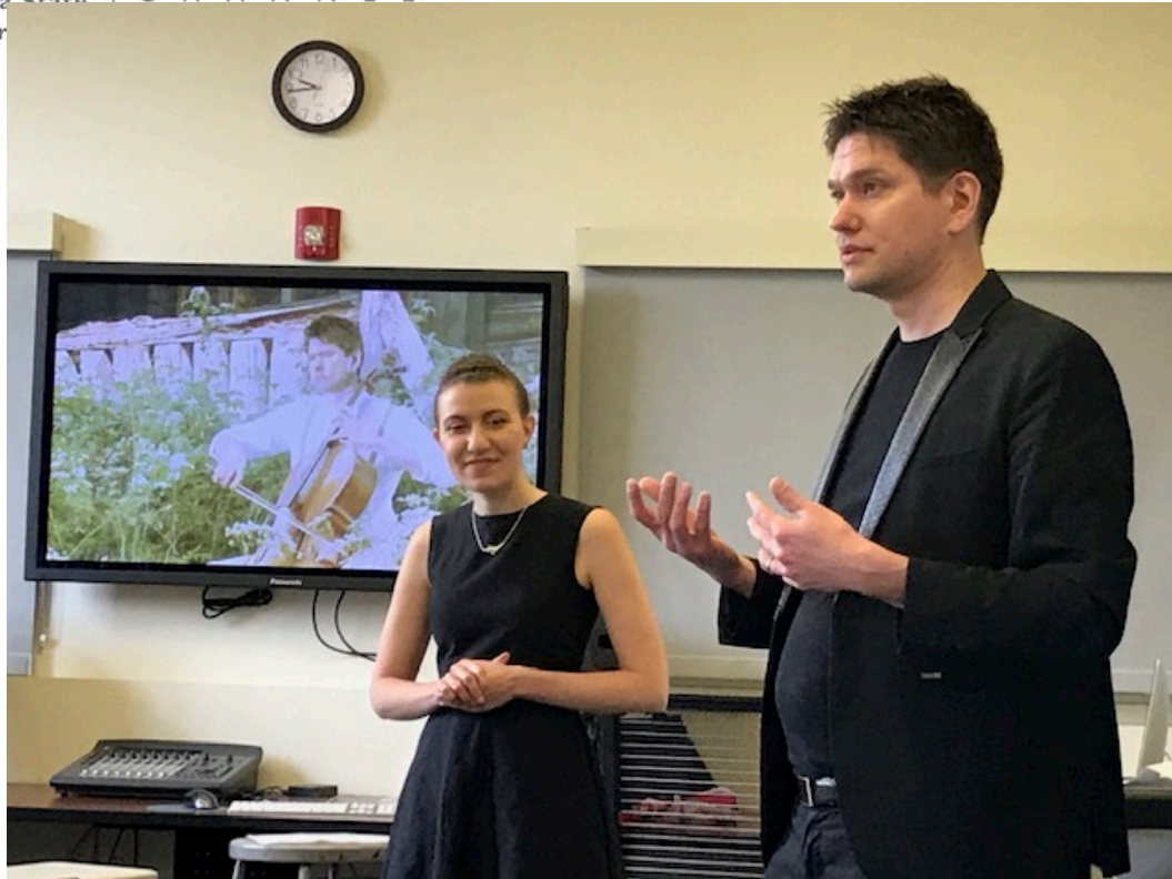
Recording class answering questions about making music videos