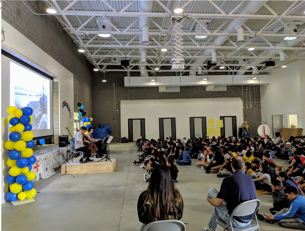
Performance in Rio Del Sol, Oxnard.