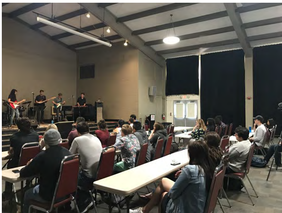
Oct. 28: Rock music styles concert in MAL #100.

The student feedback surveys from our events are attached below. On those surveys you will see a list of the majors and grade levels of some of the attendees in my class. We are never able to persuade all of the attendees to participate in the surveys/ There were also a number of additional people (from other classes, faculty, staff, community members) who attended the events.