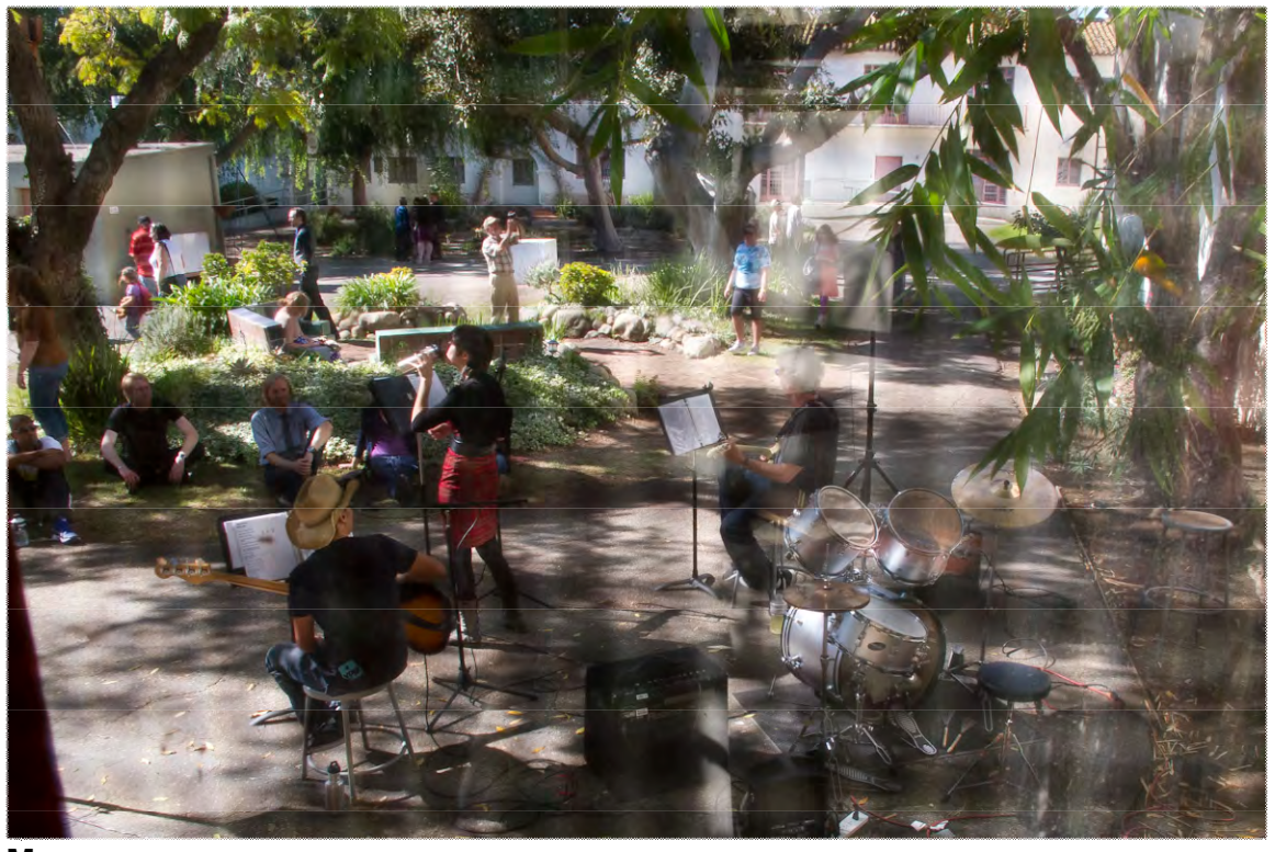
M USIC AND DANCE CREATED A FESTIVAL ATMOSPHERE ENJOYED BY ALL.