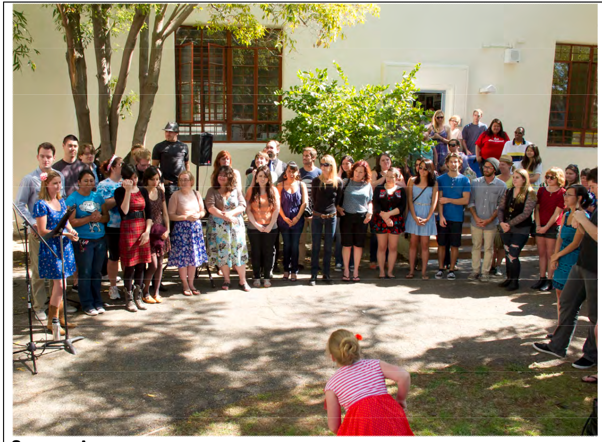
STUDENT AWARD WINNERS