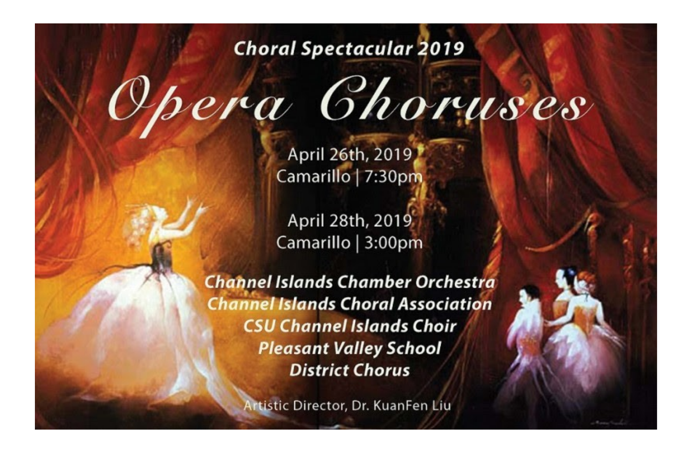
Image 1: Choral Spectacular 2019 – Choral Spectacular Goes to the Opera Poster

Please embed 3-5 images in this document (or attach in .JPEG format) that demonstrate student participation with captions/title