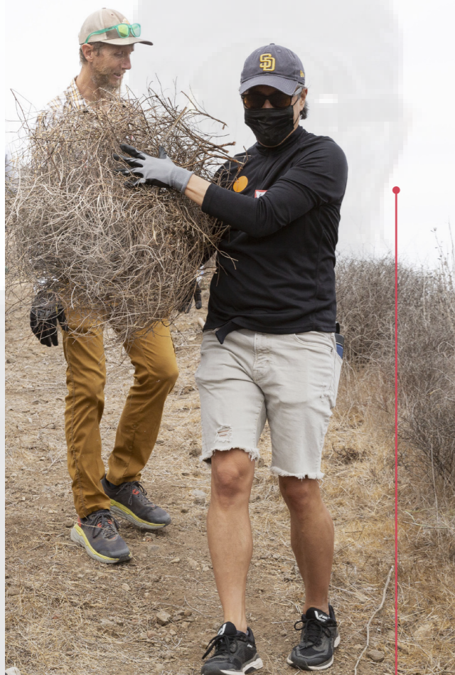
CSUCI President, 2021-Present