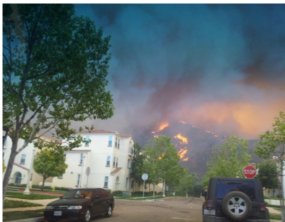
Springs Fire (2013) view from CSUCI