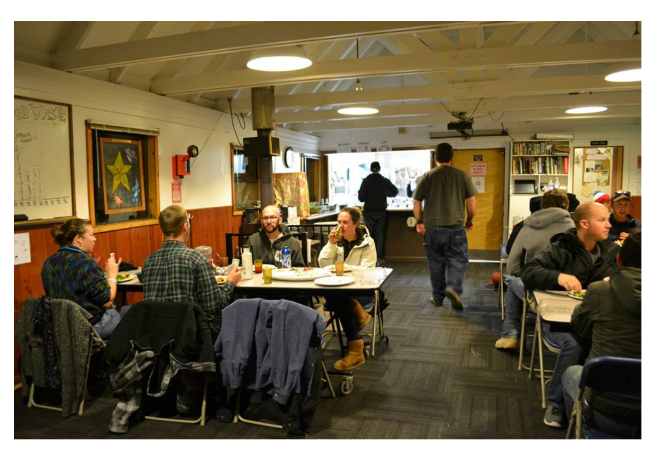
Trip participants stayed at the NatureBridge facility at Crane Flat