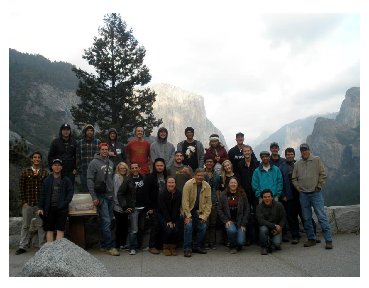
Trip participants at Tunnel View overlooking Yosemite Valley