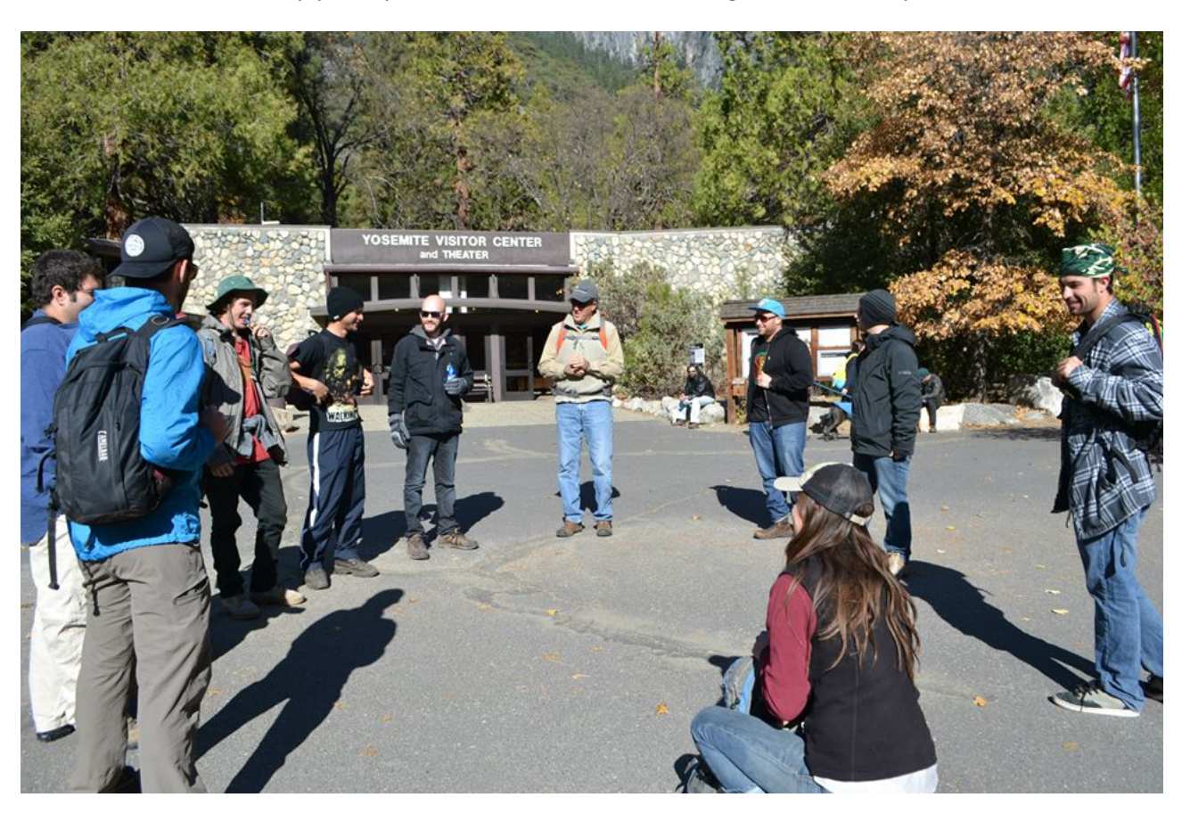
Participants met with the park superintendent and other key park leaders