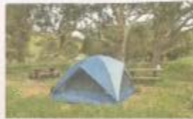
Campground, Santa Cruz Island