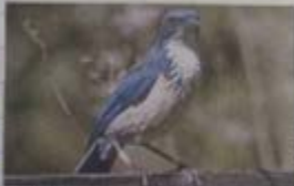
Island warbler, Santa Cruz Island