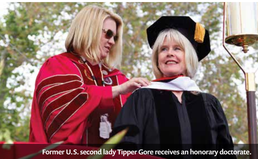
Former U.S. second lady Tipper Gore receives an honorary doctorate.