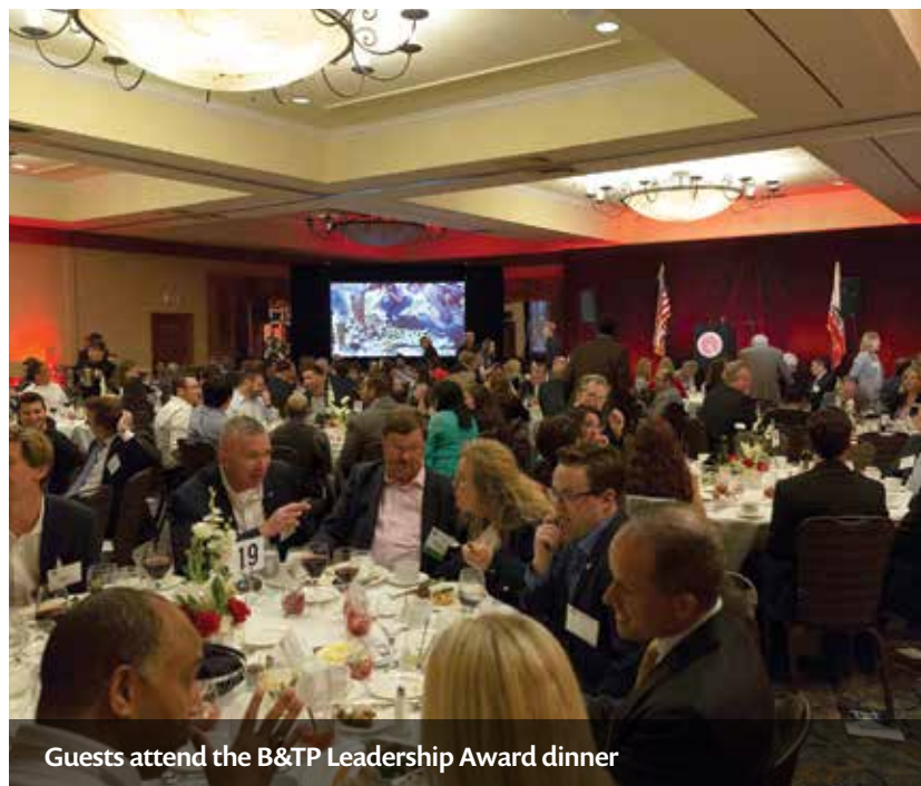
Guests attend the B&TP Leadership Award dinner