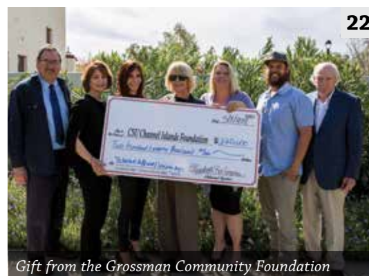
Gift from the Grossman Community Foundation