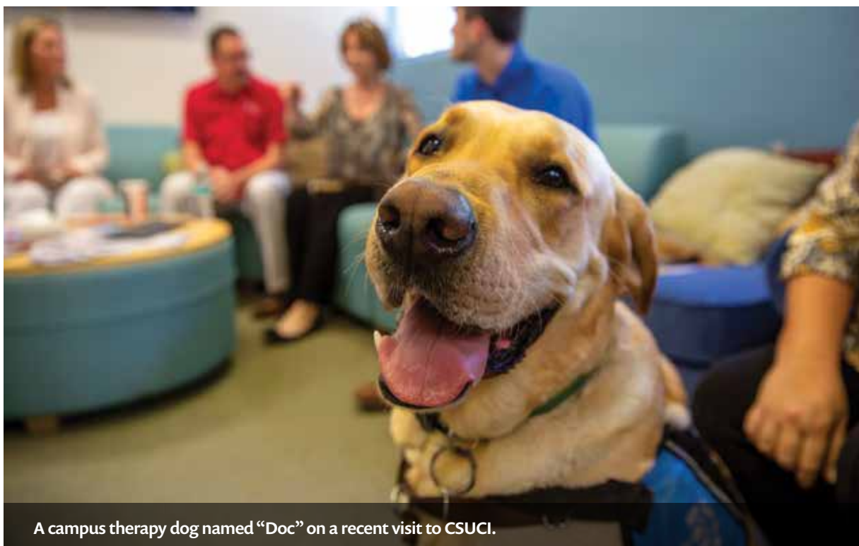
A campus therapy dog named “Doc” on a recent visit to CSUCI.