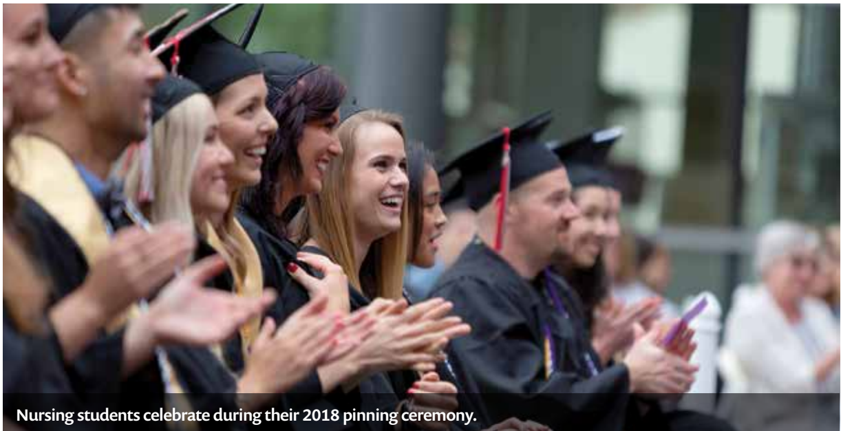
Nursing students celebrate during their 2018 pinning ceremony.