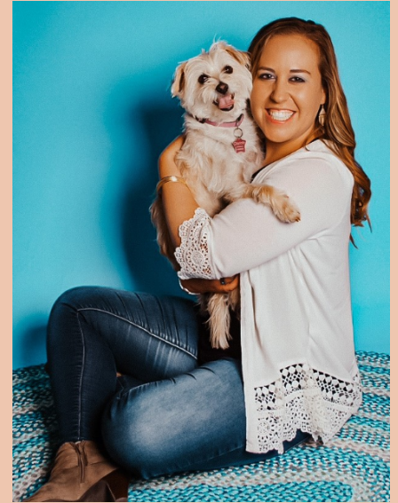
"My Valentine! My incredible service dog, Charlotte! Love her so much!"