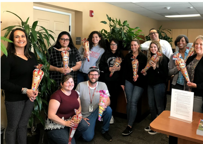
Housing & Residential Education