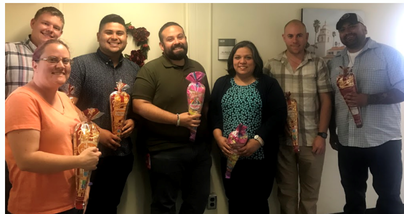
Student Systems - Enrollment Services