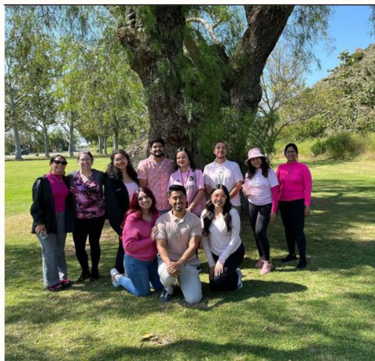
On Wednesdays We Wear Pink!

Thank you to everyone who has participated so far!