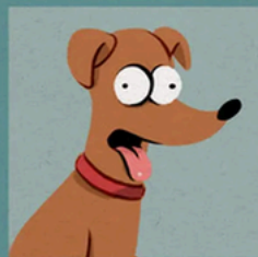
SANTA'S LITTLE HELPER