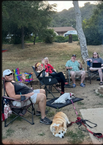
"CAMPING VIBE AND SUMMER BLISS!"