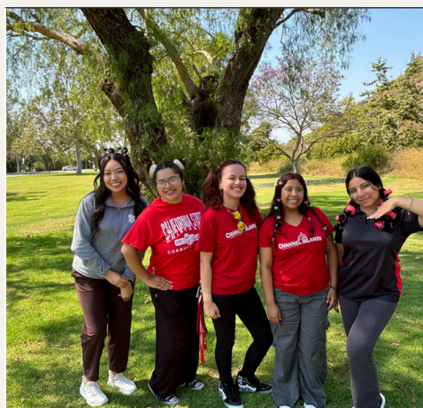
Crazy Hair Day