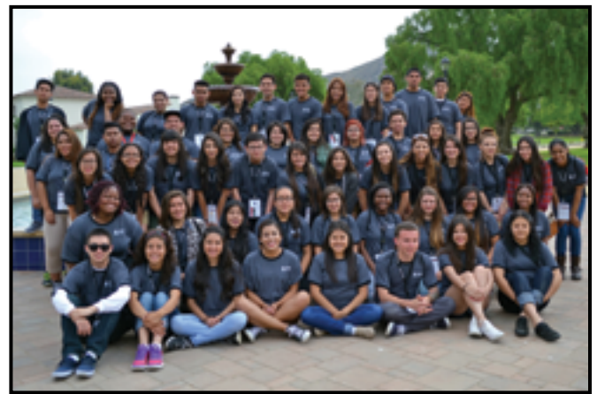
Above: EOP 2014 Summer Bridge Participants