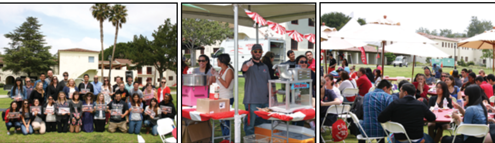
Above: Staff and students alike enjoyed the DSA Student Assistant Celebration, held on April 25, 2014.