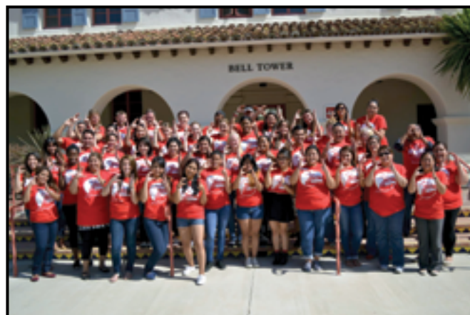
Above: CI students and staff supporting #RedOutWednesdays and showing their CI Pride.