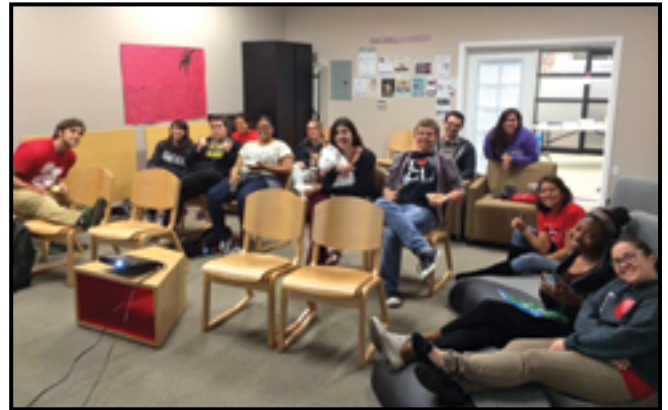
Above and below: Housing residents having fun at a Student Group Connect session.