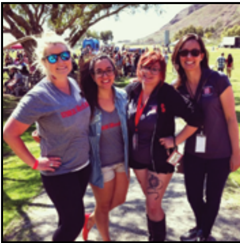
Left: The 2014 Dolphinpalooza event. Student Programming Board's (SPB) annual culminating event is Dolphinpalooza—a free outdoor festival open to CI and the surrounding community. Held on April 5, 2014, in Potrero Field, this spring's Dolphinpalooza marked the event's highest attendance yet with over 1,000 students, faculty, staff and community members joining in the festivities.