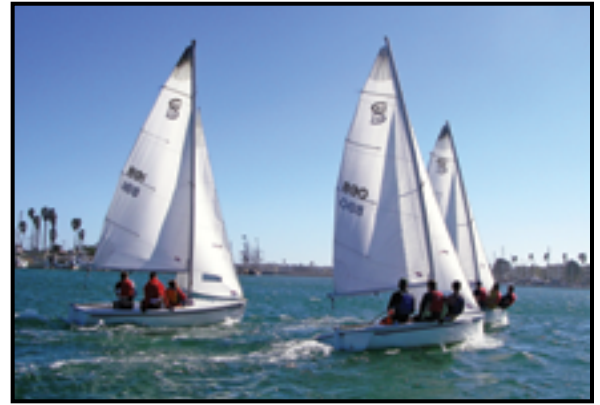
Above: The sailing club enjoying the day on the water.